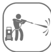
High-pressure cleaning companies