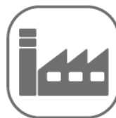
Oil, chemical and energy companies