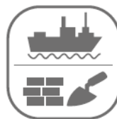
Building sites and boatyards