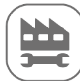
Iron and steel works and mechanical engineering firms